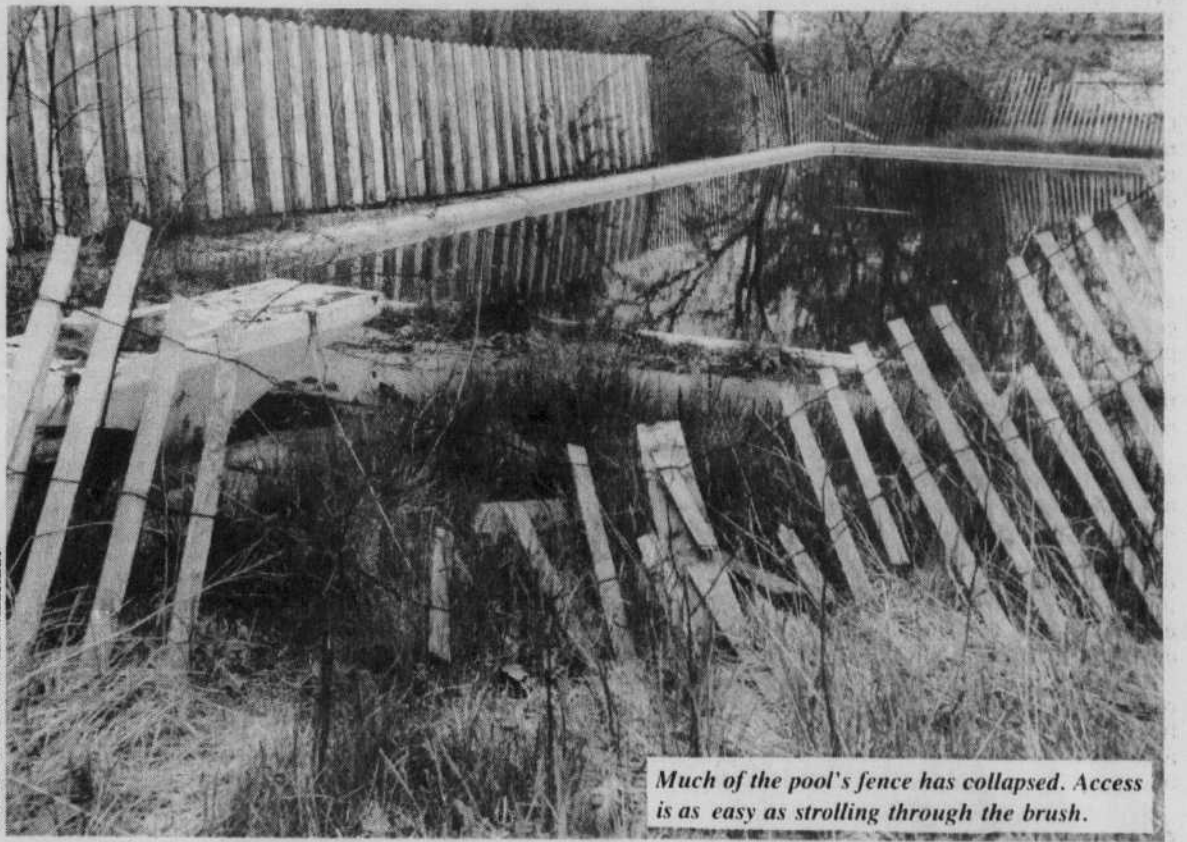
Much of the pool's fence has collapsed. Access is as easy as strolling through the brush.

Admitting the pool is "dangerous", Collard said children are often in the area before and after school.