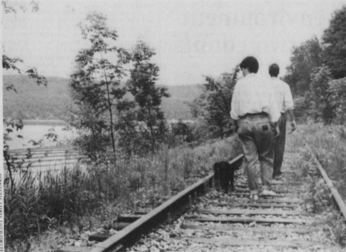
Strollers already often use the abandoned Lennoxville to Beebe railbed as an informal hiking trail.

Véronneau echoes opposition to the recreational trail proposal from some property owners along Lake Massawippi who are worried about theft, vandalism, and a lack of privacy resulting from public use of the right-of-way.